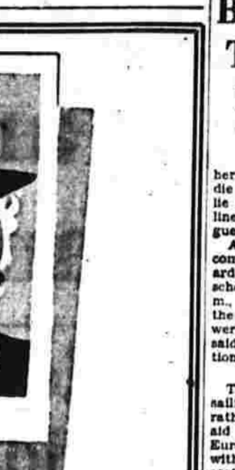
The committee said last night the primary aim of these groups is to keep away from her port. The committee also said that it is likely that the port will be kept away from her port.