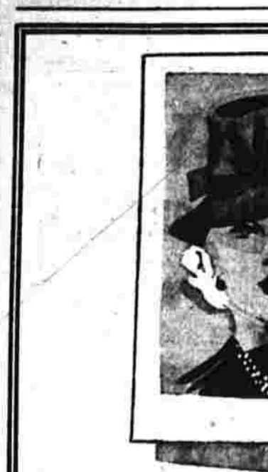
Washington, Sept. 1.—(AP)—The Dies Committee declares the United States has many "peewee Hitlers" who are guilty of racketeering as well as a variety of other crimes.